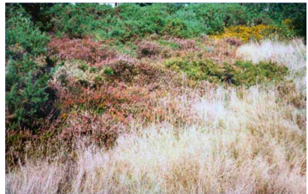
Figure 5: Grass-heath-scrub mosaic providing an ideal combination of microhabitats for thermoregulation.