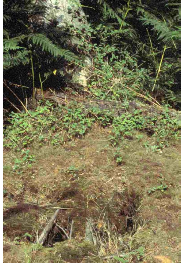
Figure 4: Crevices leading to exposed root system, in sun-exposed location at scrub edge, provides good hibernation opportunities.