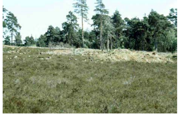
Figure 7: Extensive heather stands which are highly uniform in structure and low in average height provide poor habitat for reptiles (though such conditions are normal in early stages of heathland establishment).