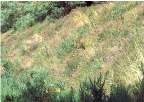
Figure 2: South-facing bank (important basking/hibernation opportunities), with good quality structure provided by grass-heath mosaic.