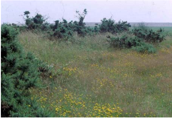
Figure 1: Good grassland structure, showing variation from short sward up to gorse scrub.