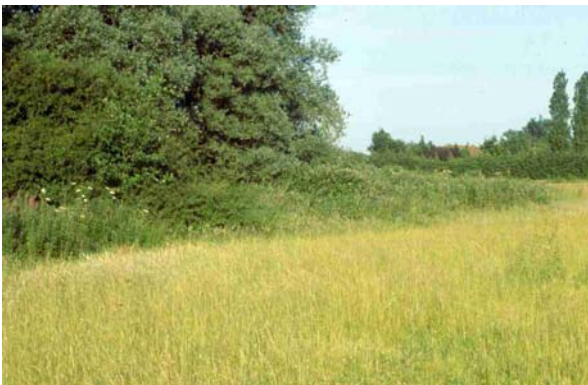
Figure 3: South-facing woodland edge provides an important linear feature for many reptiles.