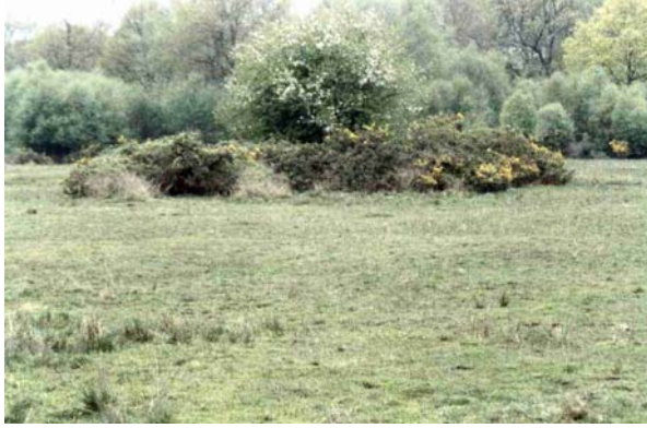
Figure 6: Uniform, very short sward grassland provides poor reptile habitat (here due to high grazing intensity). Large areas of entirely open habitat mean that thermoregulation is difficult and predation risk is greatly increased.